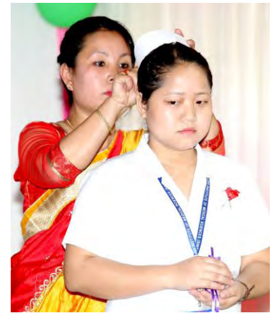
Students of Arunachal Lamp Lighting