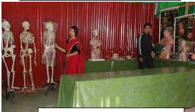
PRE CLINICAL SCIENCES