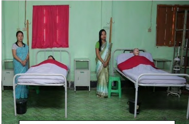
NURSING PRACTICE / FON LAB.