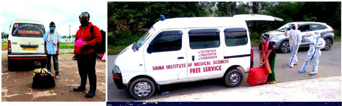
Manipur during( covid-19 ) hunger of pandemic SIMS Helping Teams supplied “ Free Ambulance Service, included Oxygen” “ Free covid test. Free Medical Camp, Free foods” And “Free Health care home services ” SIMS Helping Groups - SIMS Staffs, Nurses , paramedical , Doctors & Drivers.