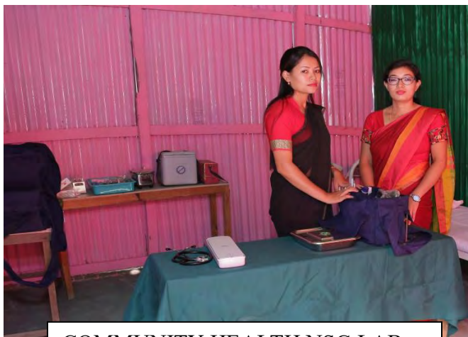
COMMUNITY HEALTH NSG.LAB.